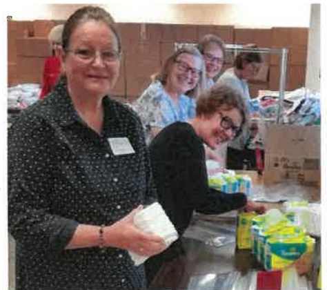
Parishioners can volunteer with Second Stork, one of our community partners.

On behalf of the incredible staff at Assumption (my emphasis) and on behalf of our community partners, I offer a heartfelt thank you to those who volunteer and help out in so many ways.