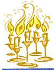
This day shall be a day of remembrance for you XXXXXXXXXX

All parishioners and families are invited to a beautiful service of prayer and song that will commemorate the lives of those who have died during the past year. The liturgy begins at 3:00pm in the church. We especially remember those from our parish who have died . . .