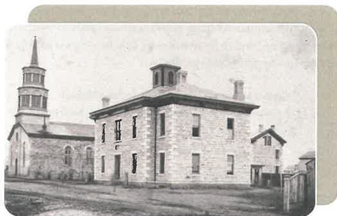
Assumption's Historic School Building is pictured to the right of the original church.

Renovation to this building will include an elevator, office space, restrooms, classrooms, kitchen and an updated mechanical and utility infrastructure. Additionally, the plans will protect the building from further deterioration and have modern, energy efficient windows. There will be significant mortar and stone repair on the exterior façade. With proper landscaping and sidewalks, this building will become an integral part of our campus experience. The goal is to accomplish all of this while maintaining the integrity of this historic gem – the second oldest building and oldest standing school in St. Paul.