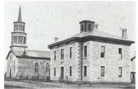
The historic school building is pictured to the right of the original church.