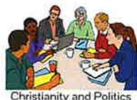
Christianity and Politics